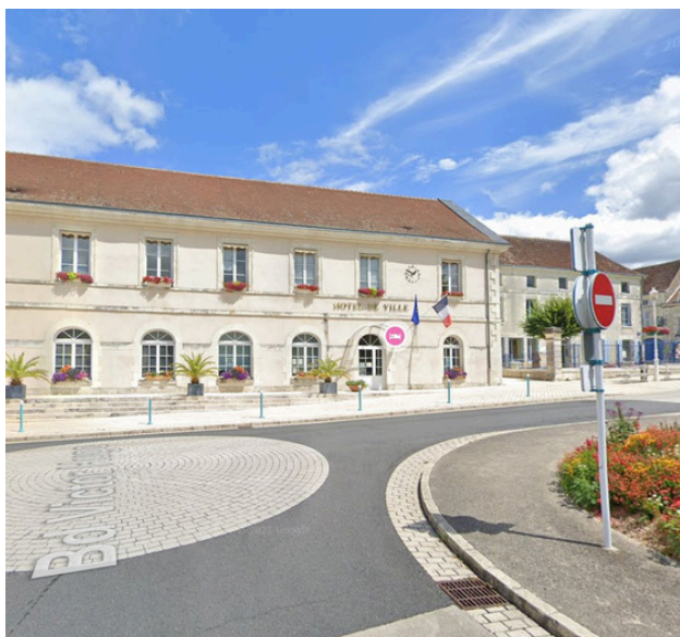
Step 1: Turn right onto Rue Pierre Denis Rousseau.