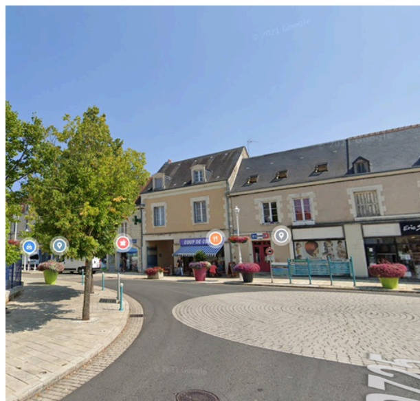
Step 2: At the roundabout, turn left onto Cour Pasteur.