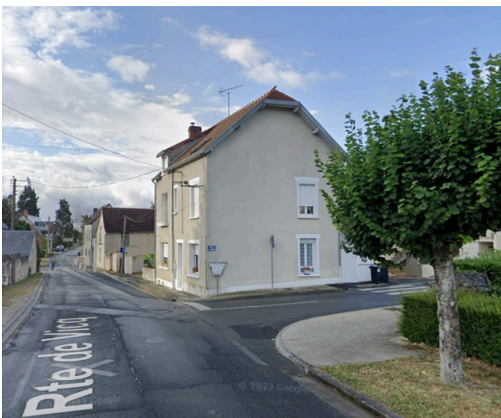
Step 4: Turn right onto Route de Crémille and continue straight for 1.4 km.