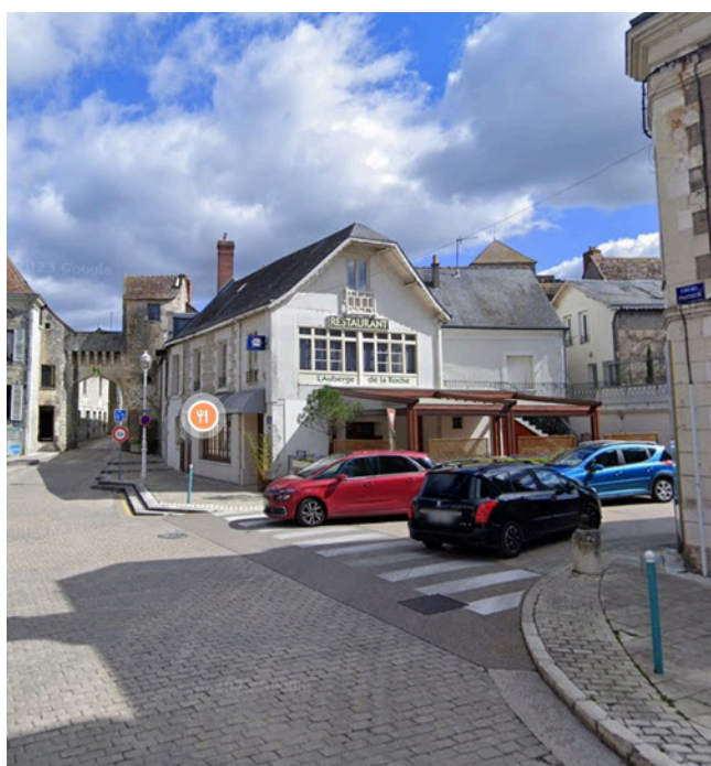
Step 3: Turn right onto Rue du Quatrième Zouave and continue for 1.4 km to reach Route de Vicq.