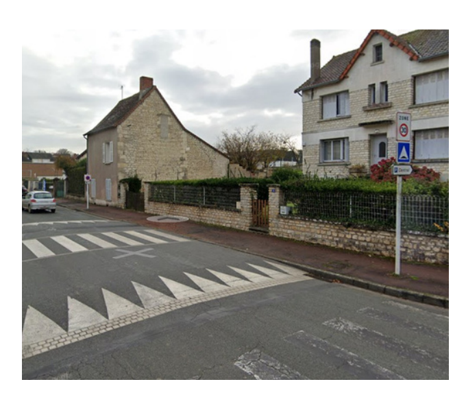
Step 10: At the exit of the Park, turn left onto Rue Pierre-Denis Rousseau.