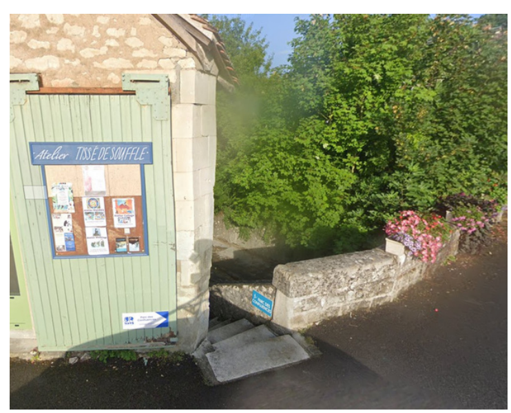
Step 9: Turn left before the bridge and take the stairs that go down into the Parc des Confluences. Continue until you exit the park.