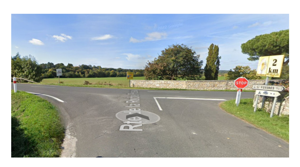
Step 7: Turn left onto the D725 and cross the bridge. Then continue straight on Rue Bourbon.

On the other side of the bridge, go forward for a few meters and take the path on the left to go back down and continue to the left to join the D725.