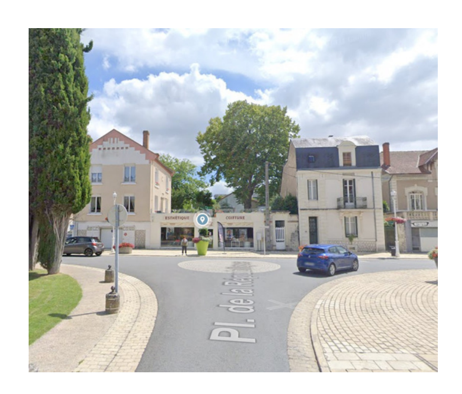
Step 1: Take a left onto Cour Pasteur.