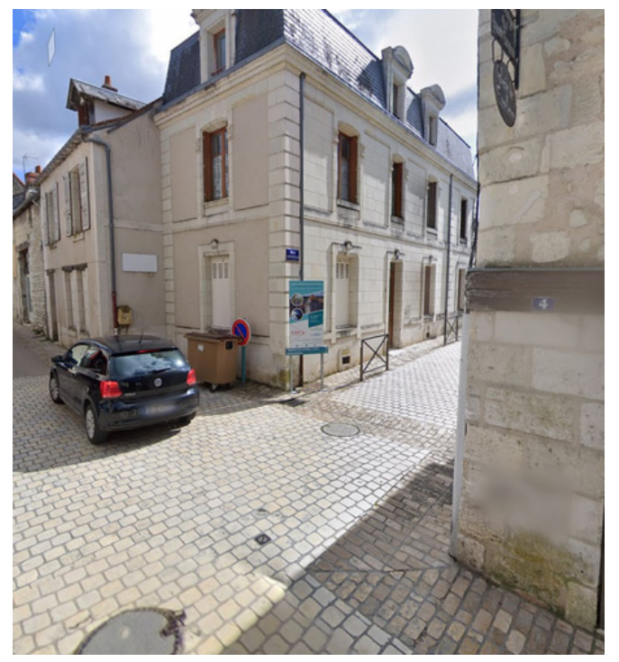
Step 2: Turn right onto Rue Duguesclin and continue straight on, passing Rue de Guyenne.