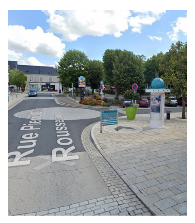
Step 11: Turn right onto Boulevard Victor Hugo and find the Tourist Office