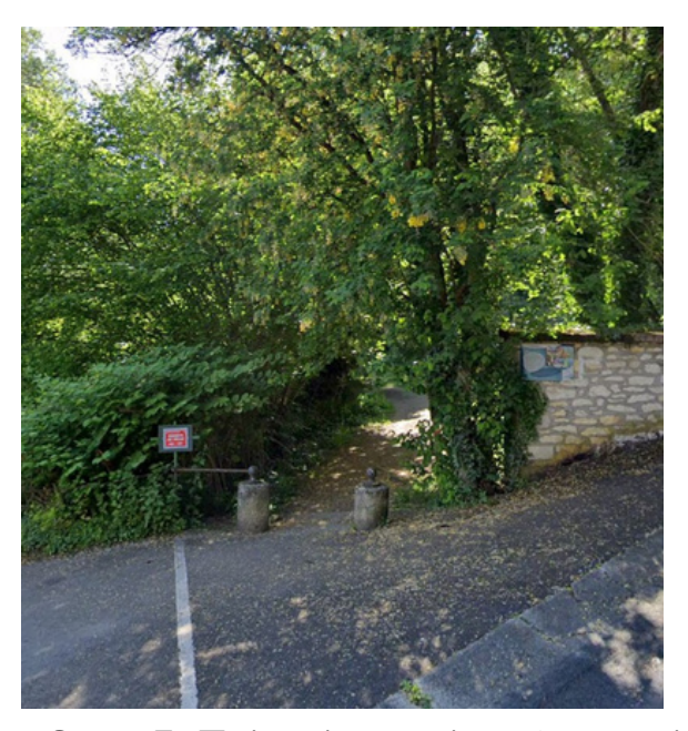
Step 5: Take the pedestrian path on the right and continue straight on to Baignade.