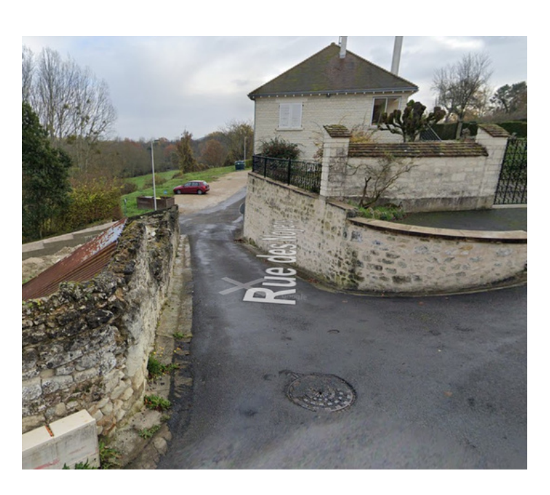
Step 3: Turn left onto Rue des Noyers.