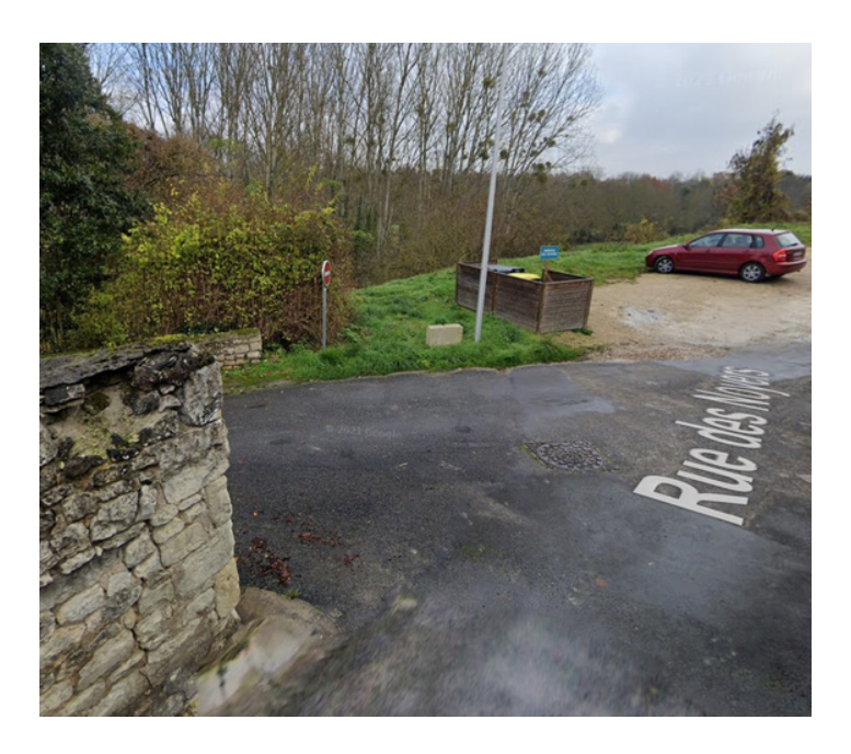
Step 4: Then turn directly left to get back to Rue des Remparts.