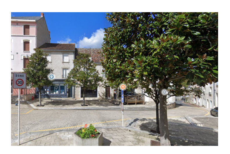
Step 8: Turn immediately right after the city gate onto Rue du Falk.