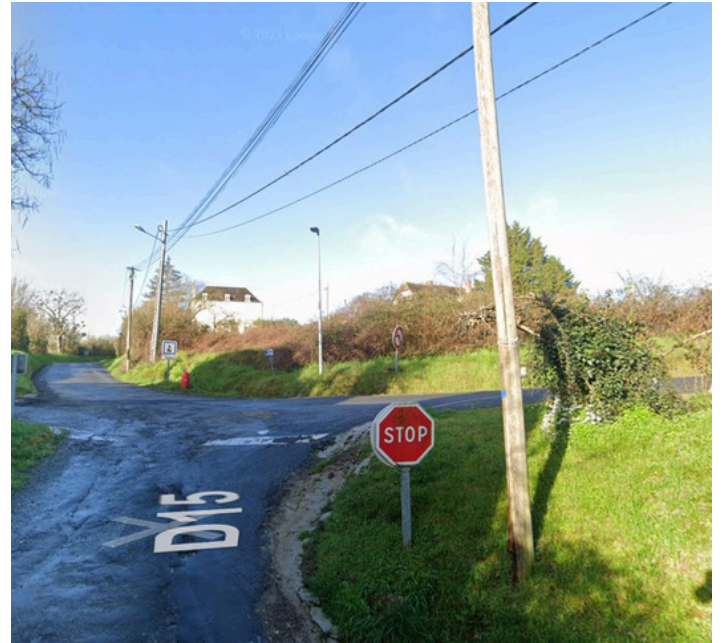
Step 3: At the intersection, turn right onto Rue Renoir, then continue straight.