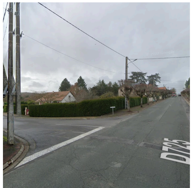
Step 5: Turn left onto Chemin des Sarrazins and continue straight on.