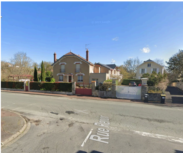
Step 4: At the stop sign, turn left onto Rue Pierre Denis Rousseau.