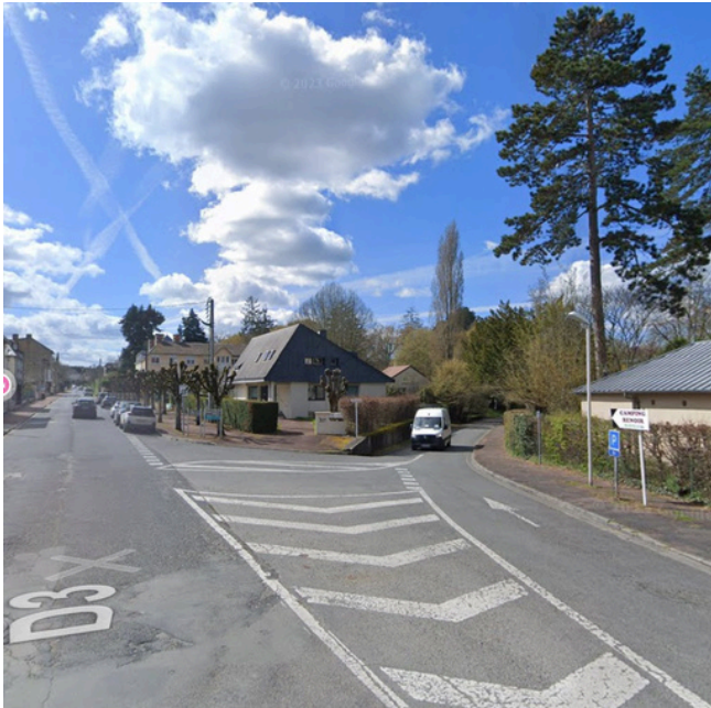
Step 2: Turn right onto Rue des Enfants de Troupes.