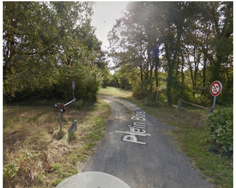
Step 14: Turn left onto the path of the old railway line and continue straight on for 3.1 km.