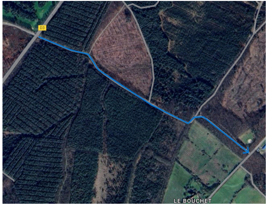
Step 12: Continue straight until you reach the road. Then turn right.