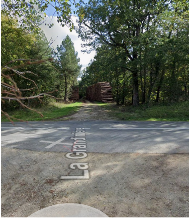
Step 11: Take the footpath opposite and follow the route of the next stage.