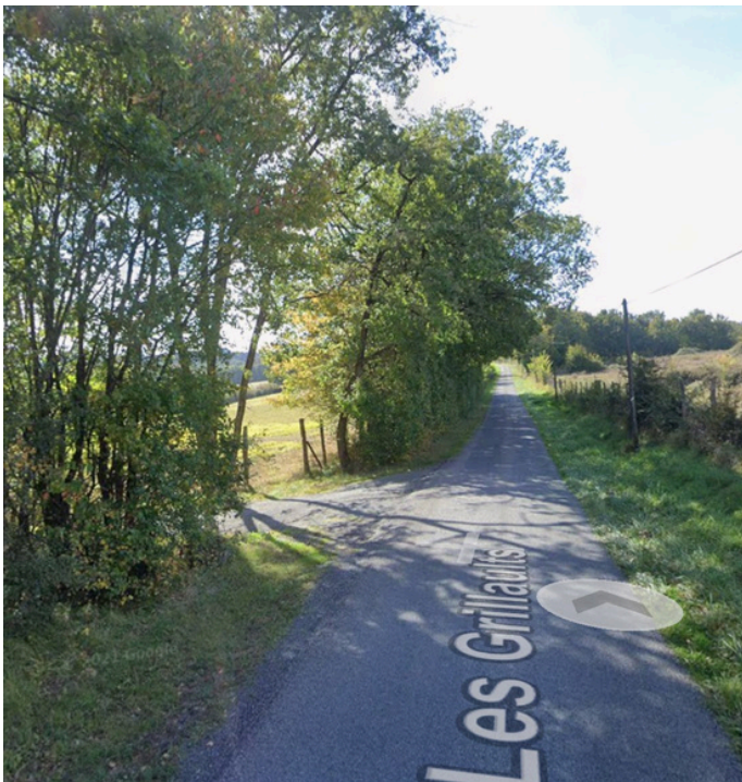
Step 13: Turn left onto the footpath. Then continue straight.