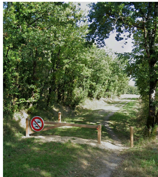
Step 15: Turn left and take the Ligne footpath from Châtelleraut to Launay. Continue straight for 2.4 km.