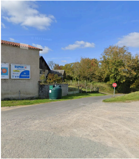
Step 16: Cross Avenue de la Gare and take Rue de la Baignade.