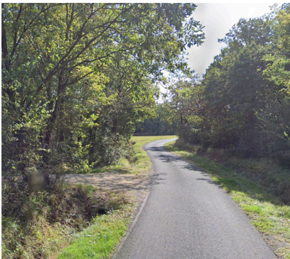
Step 14: Turn left onto the path.