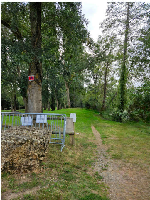
Step 18: At Baignade, turn left and take the footpath.