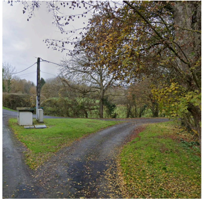
Step 17: Turn right onto Rue de la Baignade and go straight on.