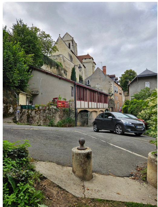
Step 19: At the end of the path, turn right onto Rue des Remparts and continue straight on.