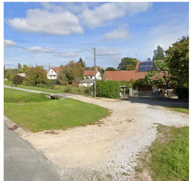
Step 16: Turn right onto the path, cross the bridge and continue straight on to Avenue de la Gare