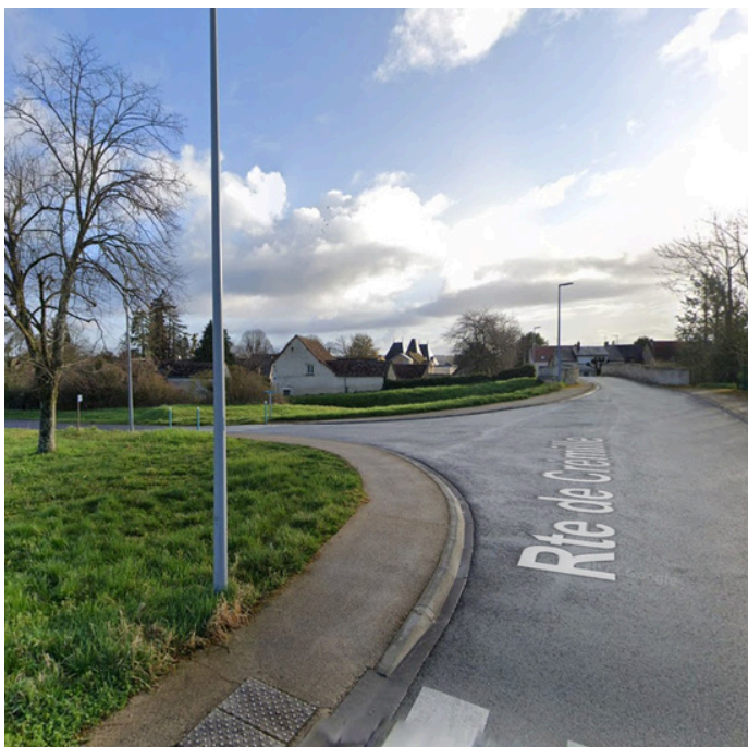
Step 15: Turn left onto Rue du Général de Gaulle and continue straight until the next road on the right.