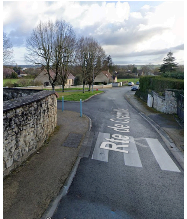
Step 14: Ignore the intersections and continue straight on Route de Crémille