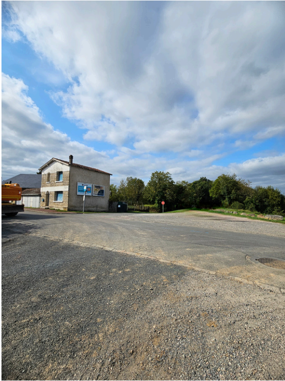
Step 17: Cross Avenue de la Gare and continue straight on the path “Les Jardins des Grands Prés”