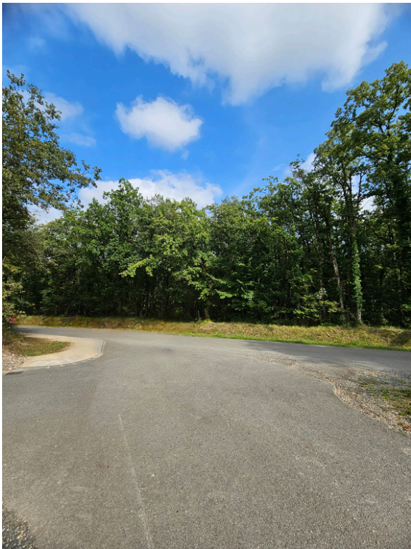
Step 13: At the intersection, turn left onto Route de Crémille