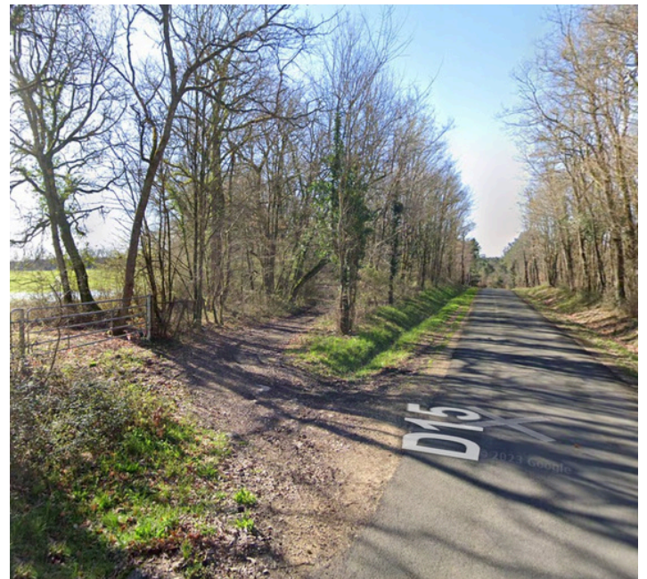
Step 13: Turn left onto the footpath and follow the route of the next stage.