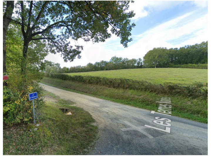
Step 11: Turn left and continue straight for 1.9 km.