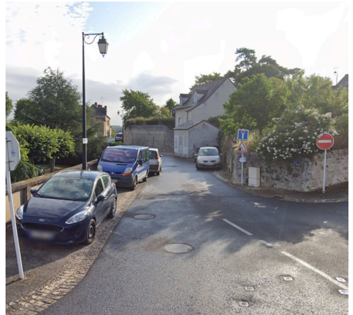
Step 5: At the exit of the stairs, take Rue de la Cale opposite and go down to the bottom of the street.