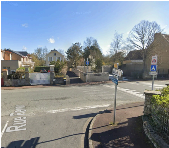
Step 4: Continue straight on into the dead end.