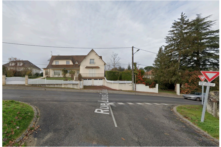
Step 3: Turn right onto Rue Renoir.