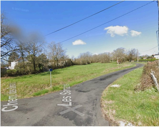
Step 10: Turn right onto Rue des Hirondelles.