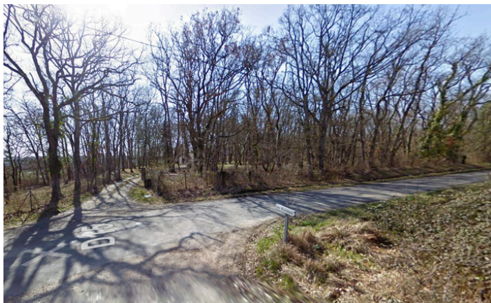
Step 12: At the intersection, turn right onto the D15. Then continue straight for 450 m.