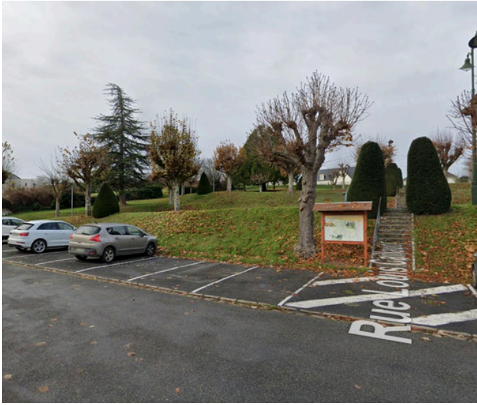
Step 2: Go back up Rue Louis Caillaud.