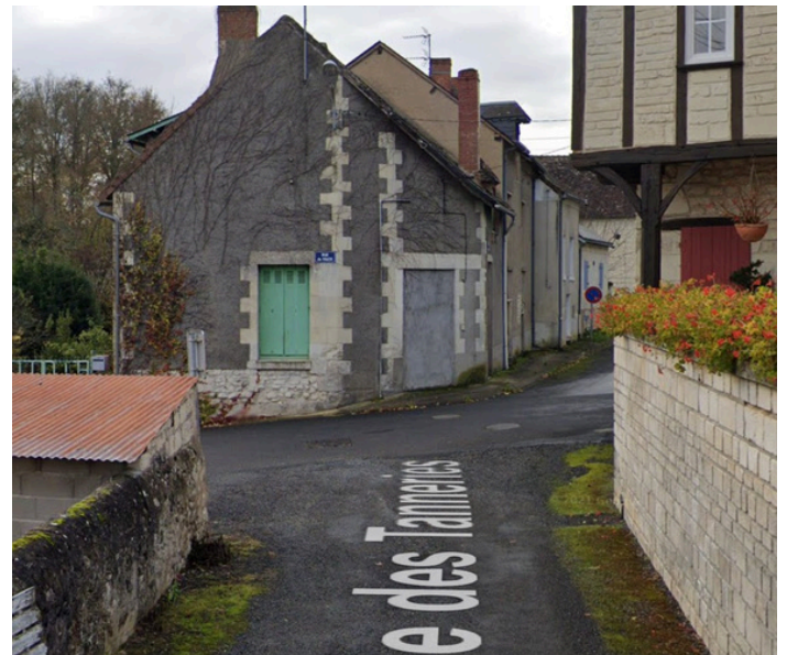
Step 17: Turn left onto Rue du Falk and cross the bridge.