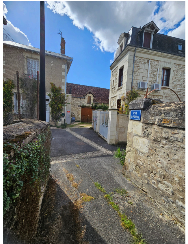
Step 13: At the end of the path, turn right and continue to the end of Rue Mirabeau.