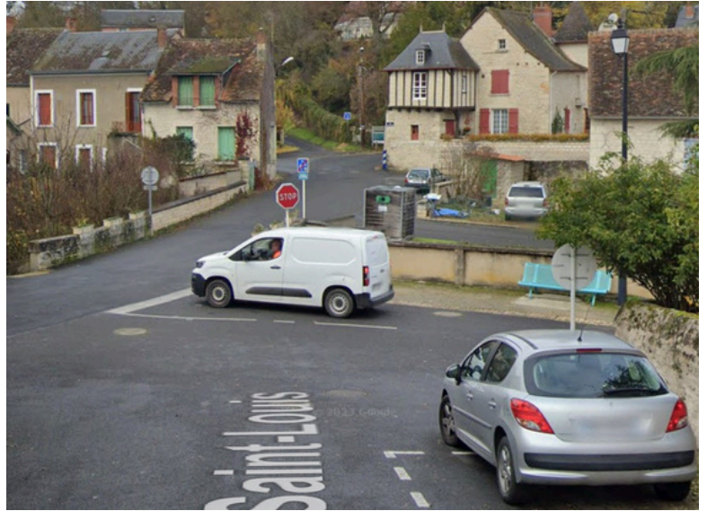
Step 15: Turn right onto Rue de la Cale and continue to the end of it.