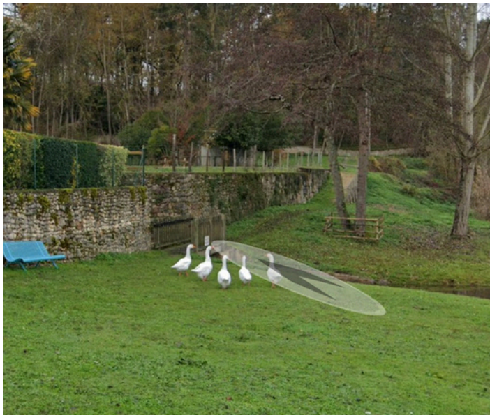
Step 16: Turn left to join the path and cross the bridge to reach the end of Rue des Tanneries. Go back up Rue des Tanneries.