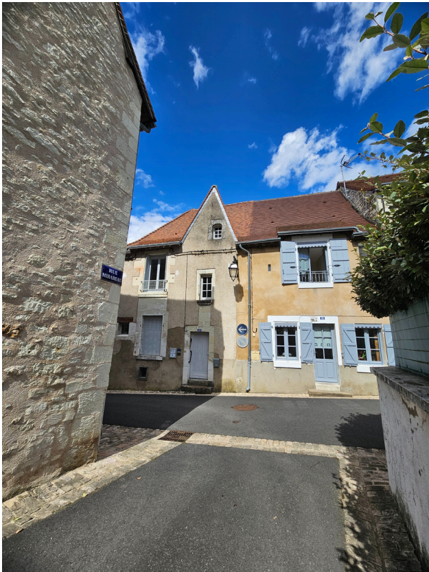
Step 14: Turn left onto Rue Saint-Louis.