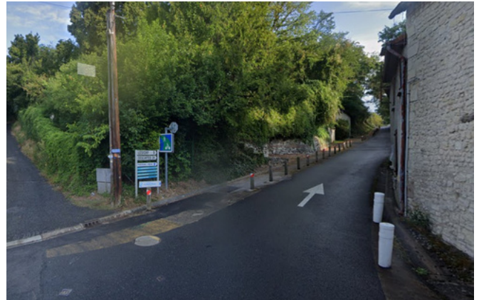
Step 4: Turn right towards Lésigny on Rue de Lésigny.