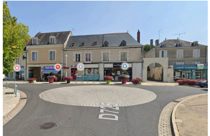
Step 2: Turn left onto Cour Pasteur