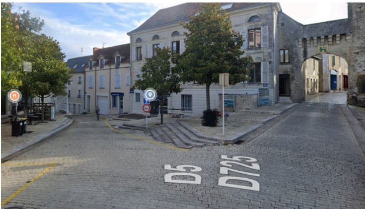
Step 3: Turn left at the intersection towards Rue de Falck.