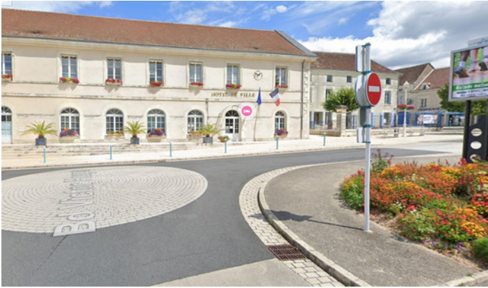
Step 1: Turn right onto Rue Pierre-Denis Rousseau