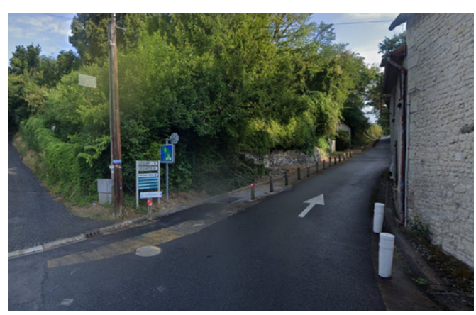
Step 4: Turn right towards Lésigny on Rue de Lésigny.