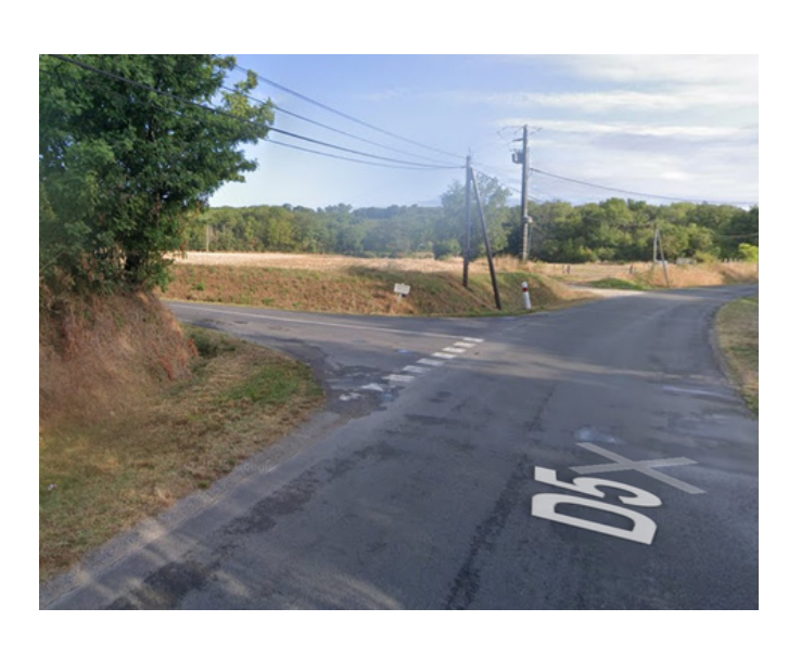
Step 6: Turn left onto "Les Moraux".