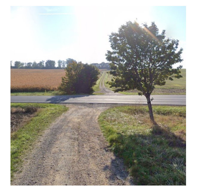
Step 9: Cross the D725B with caution and continue straight ahead on the pedestrian path. Then at the end of this path, turn left onto Chemin du Boulereau.