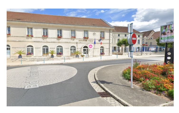
Step 1: Turn right onto Rue Pierre-Denis Rousseau