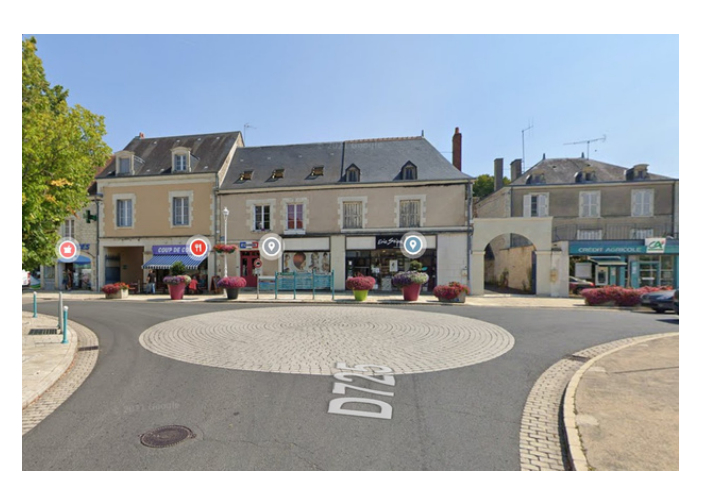
Step 2: Turn left onto Cour Pasteur