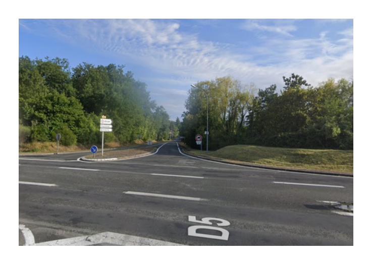
Step 5: Cross the D725B carefully, then continue straight on for around 700 m.