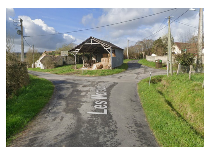
Step 7: Turn left following the "Les Moraux" road to the village of Neussouan.