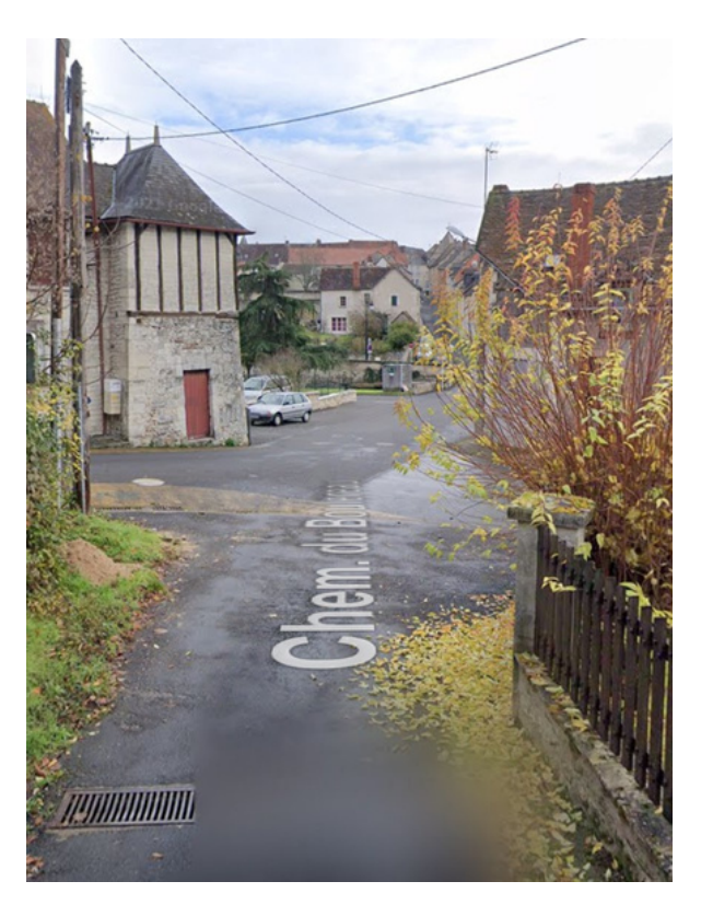
Step 10: Continue straight on Rue Du Falk.