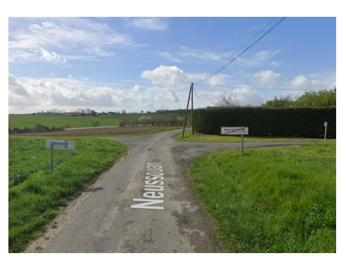
Step 8: At the exit of the village of Neussouan, turn left onto the pedestrian path.