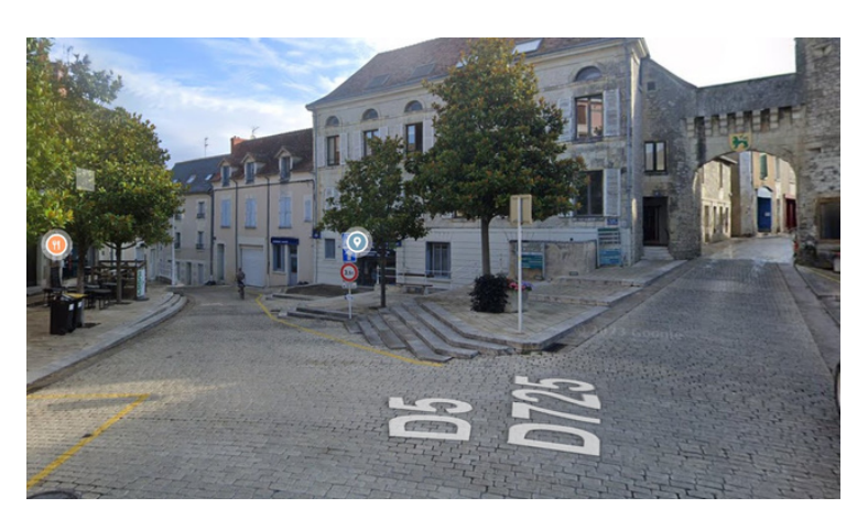
Step 3: Turn left at the intersection towards Rue du Falk.