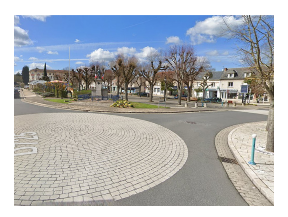
Step 12: Turn right onto Rue Pierre-Denis Rousseau, then left onto Boulevard Victor Hugo to find the Tourist Office.