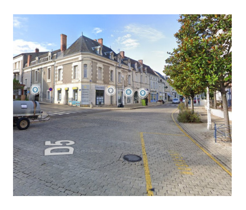
Step 11: Turn slightly to the right into Cour Pasteur.